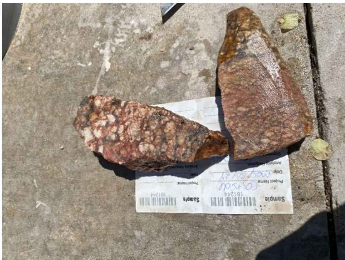
Figure 5 – Rare earth element sample 181244 displaying 0.14 wt% TREO hosted within granite

To view an enhanced version of this graphic, please visit: