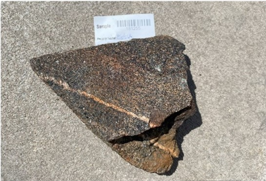
Figure 3 – Uranium sample 181255 displaying 0.07 wt% U 3 O 8 hosted within granodiorite

To view an enhanced version of this graphic, please visit: https://images.newsfilecorp.com/files/5416/222205_fig3.jpg