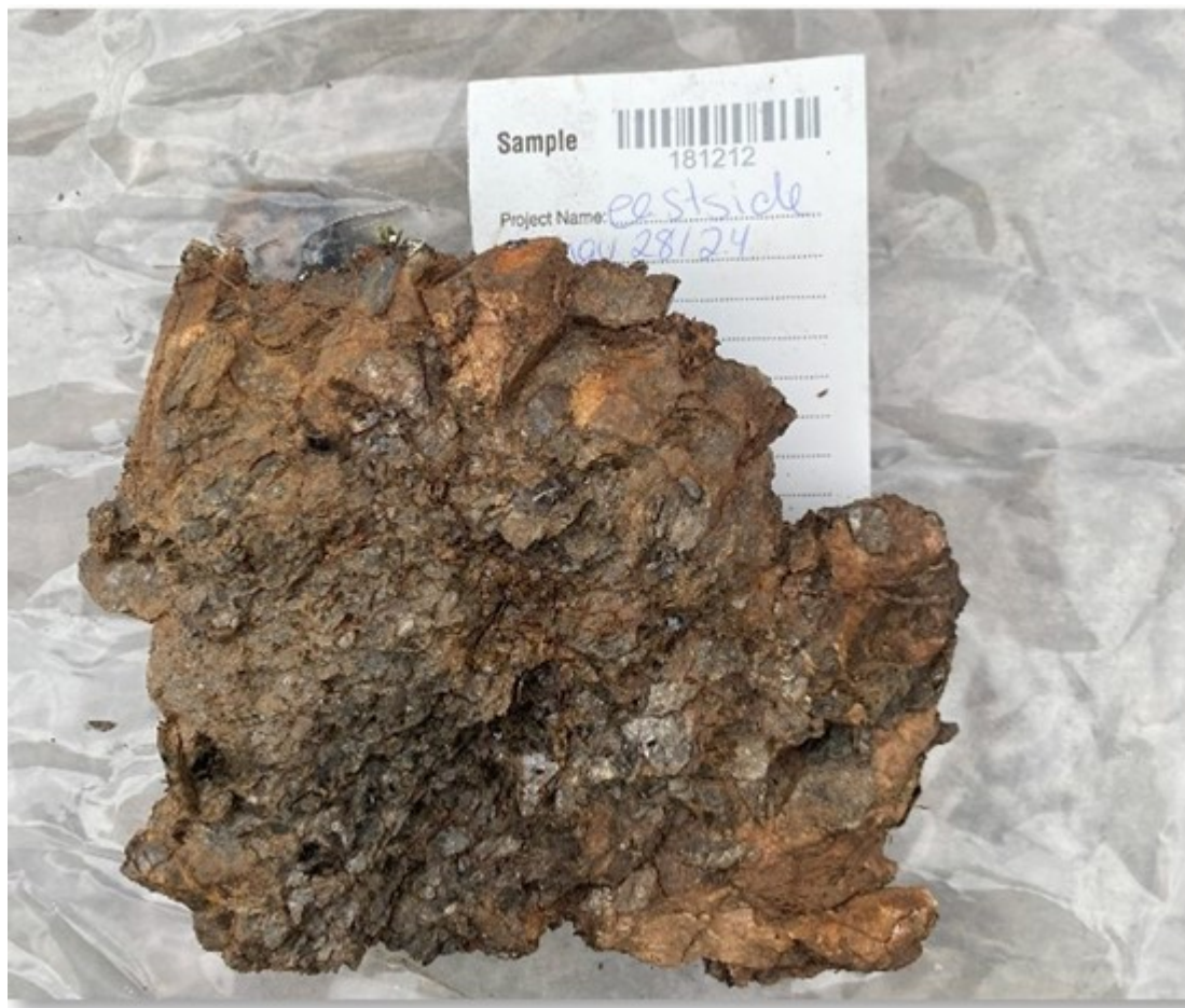
Figure 4 – Uranium sample 181212 displaying 0.06 wt% U 3 O 8 hosted within biotite-rich pegmatite

To view an enhanced version of this graphic, please visit: https://images.newsfilecorp.com/files/5416/222205_fig4.jpg