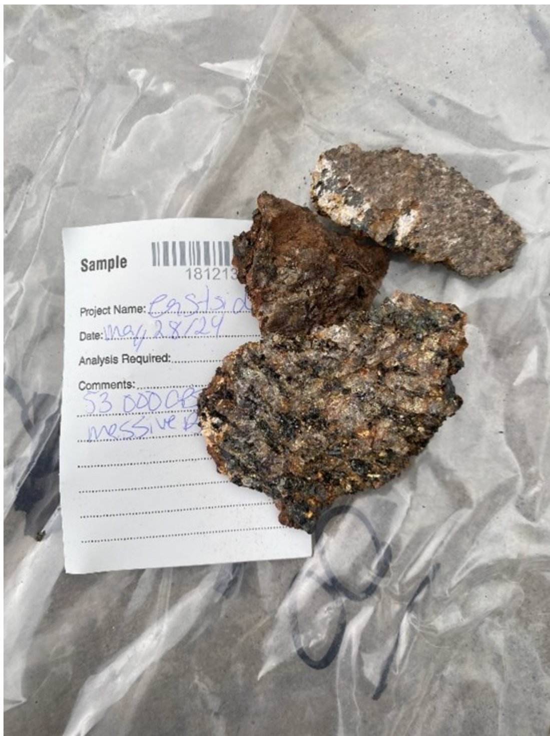
Figure 2 – Uranium sample 181213 displaying 0.25 wt% U 3 O 8 hosted within massive biotite

To view an enhanced version of this graphic, please visit: https://images.newsfilecorp.com/files/5416/222205_01c223768487ca df_002full.jpg