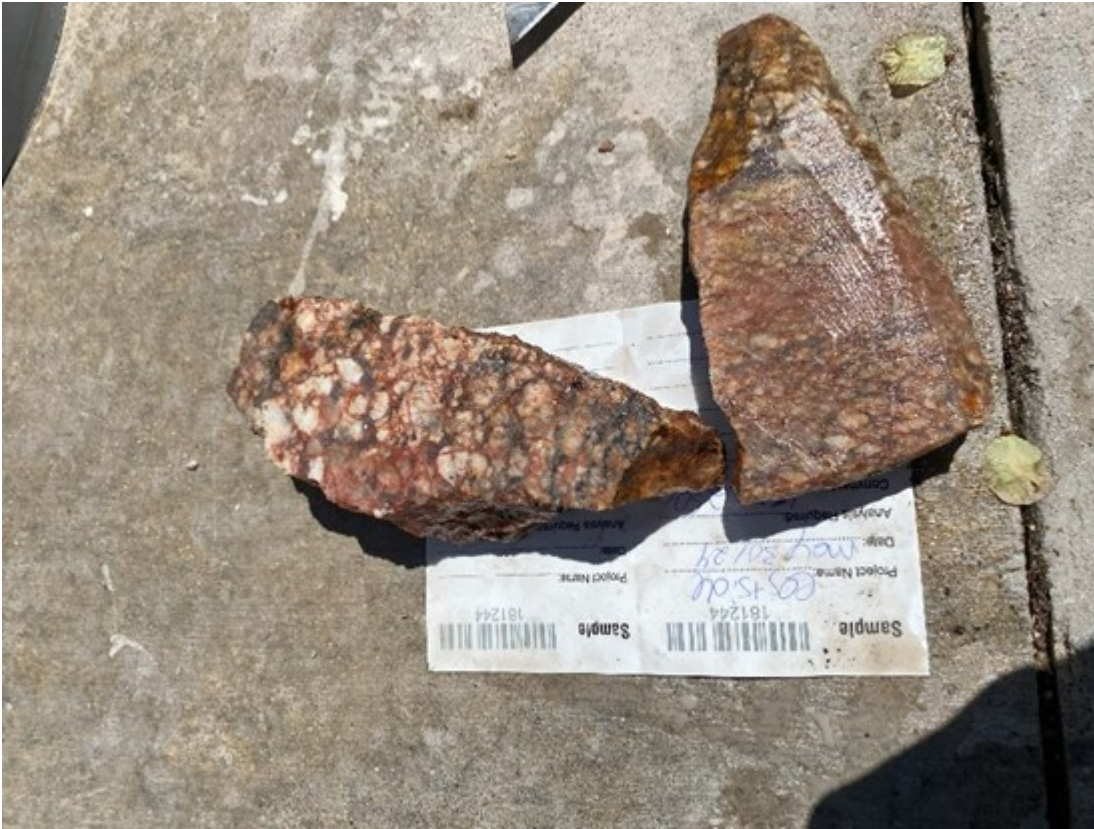
Figure 5 – Rare earth element sample 181244 displaying 0.14 wt% TREO hosted within granite

To view an enhanced version of this graphic, please visit: