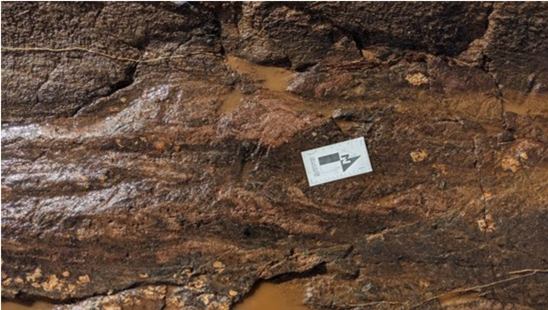
Figure 3 – Biotite-rich shear zone at SCH with “augenitic pods” of semi-massive monazite.

To view an enhanced version of this graphic, please visit: