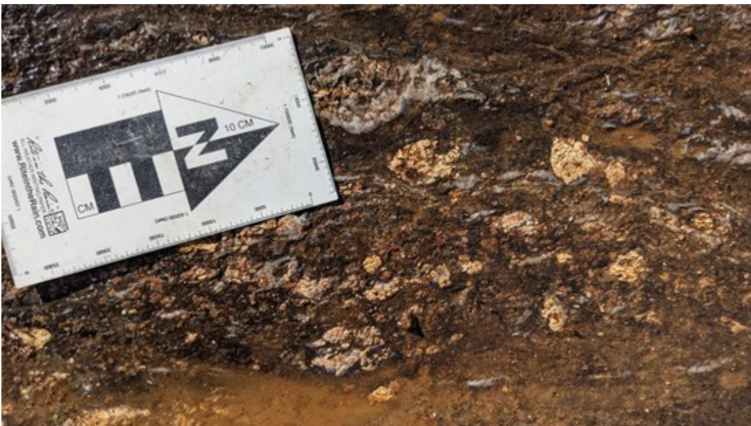
Figure 4 – Biotite-rich shear zone at SCH with coarse-grained monazite (different location than Figure 3).

https://orders.newsfilecorp.com/files/5416/93373_e8ab2e3aa4043871_007full.jpg