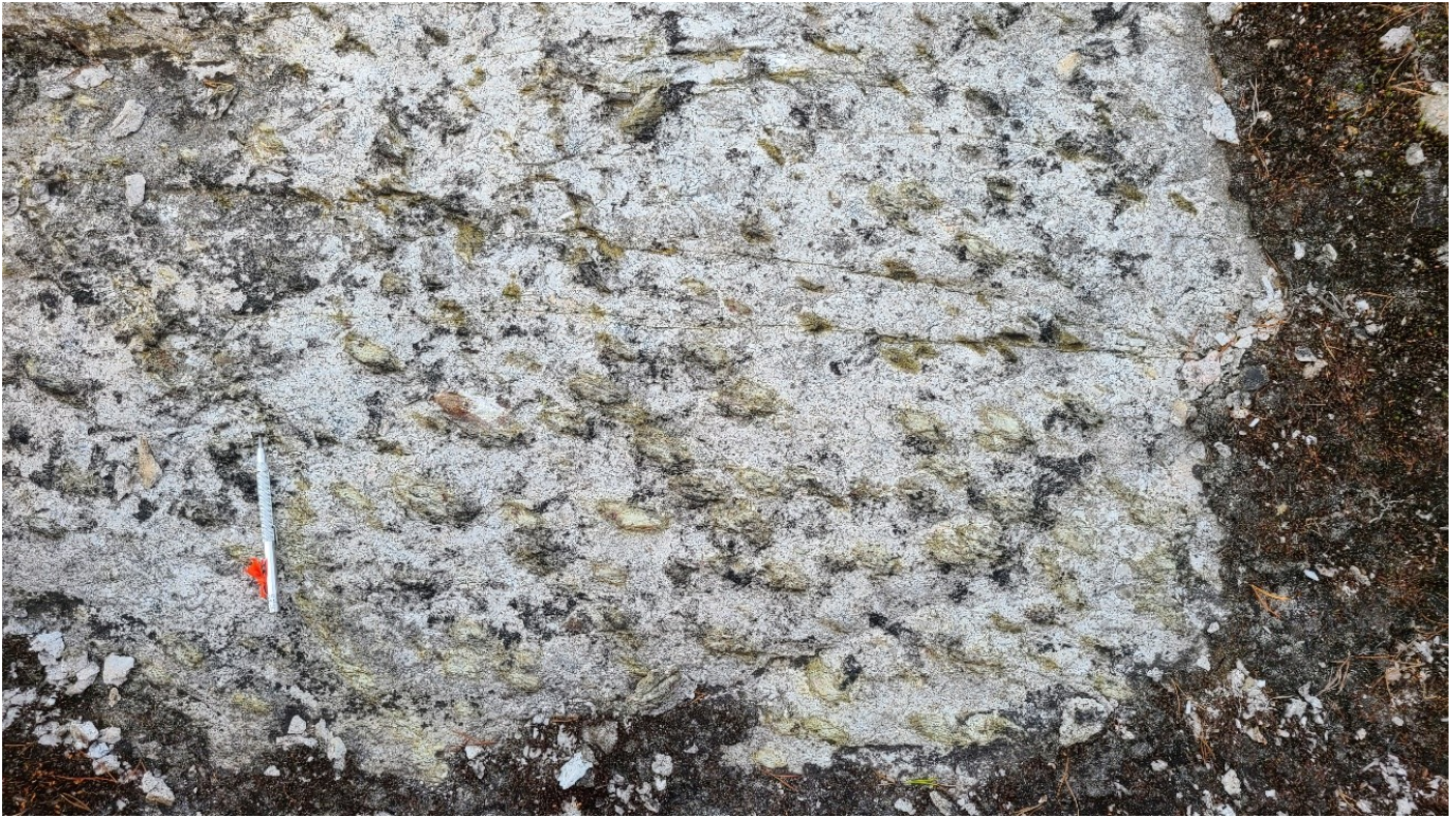
Figure 3: Main discovery. Spodumene-rich pegmatite, with aureole of Li-mica.