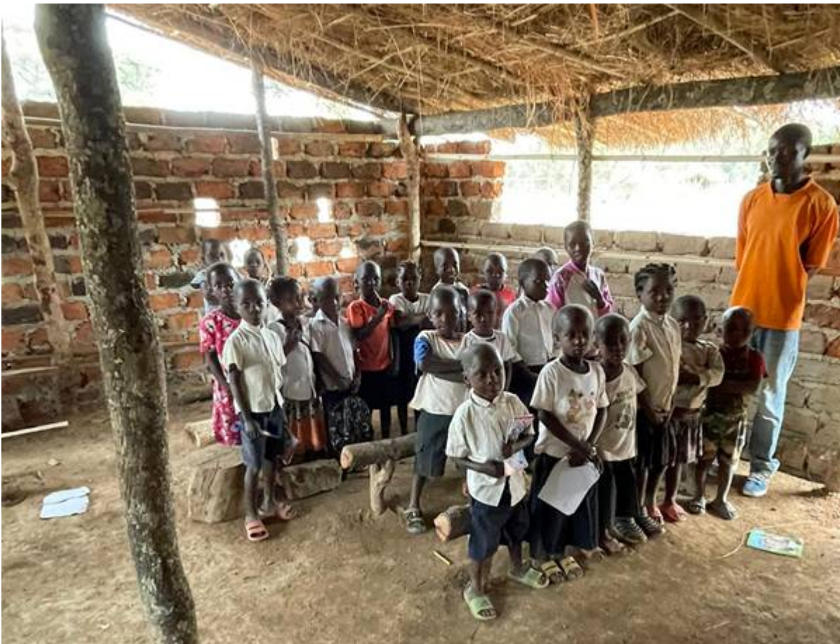
Figure 1: The teacher and the first group of students at the new Molulu Primary School.

We remain committed to invest in the community we operate, via employment – currently all of our fifty-one employees are Congolese except two. Access to education is the first step and pivotal to ensuring, where possible, local jobs go to local people in the future. We are privileged to have played a small part in this initial step and look forward to our continued collaboration with the local community.”