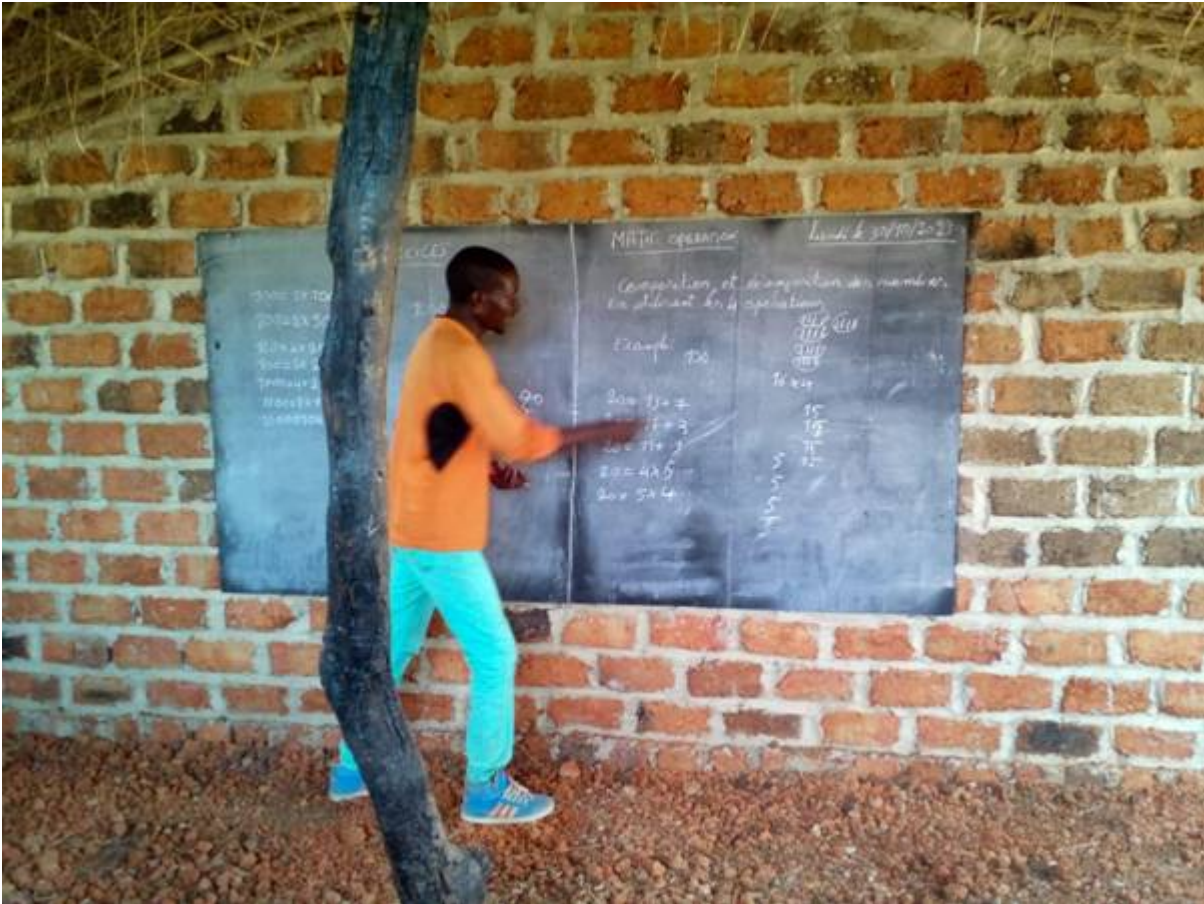
Figure 2: The First lessons start at the new E.P. Molulu Primary School.