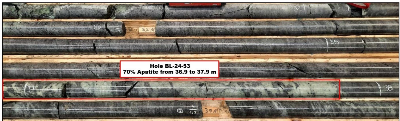
Figure 1 -70% Apatite Concentration Visible Over 1.0 m in Drill Hole BL-24-53

Multiple semi-massive apatite veins have been intersected across the 9 drill holes where the background apatite content is 30-35%. These results compare well in terms of the apatite content discovered in this zone during last fall's surface sample prospection program where more than 50% of surface samples returned results of above 10% P_2O_5 . These 9 drill holes have been prioritized for assay analysis and their data should be available in the coming weeks.