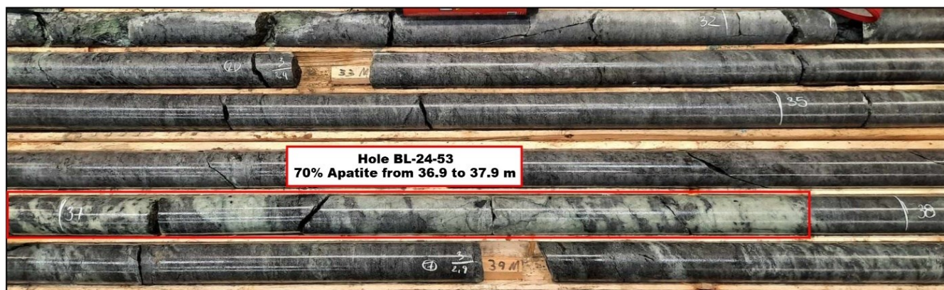
Figure 1 -70% Apatite Concentration Visible Over 1.0 m in Drill Hole BL-24-53

Multiple semi-massive apatite veins have been intersected across the 9 drill holes where the background apatite content is 30-35%. These results compare well in terms of the apatite content discovered in this zone during last fall's surface sample prospection program where more than 50% of surface samples returned results of above 10% P_2O_5 . These 9 drill holes have been prioritized for assay analysis and their data should be available in the coming weeks.