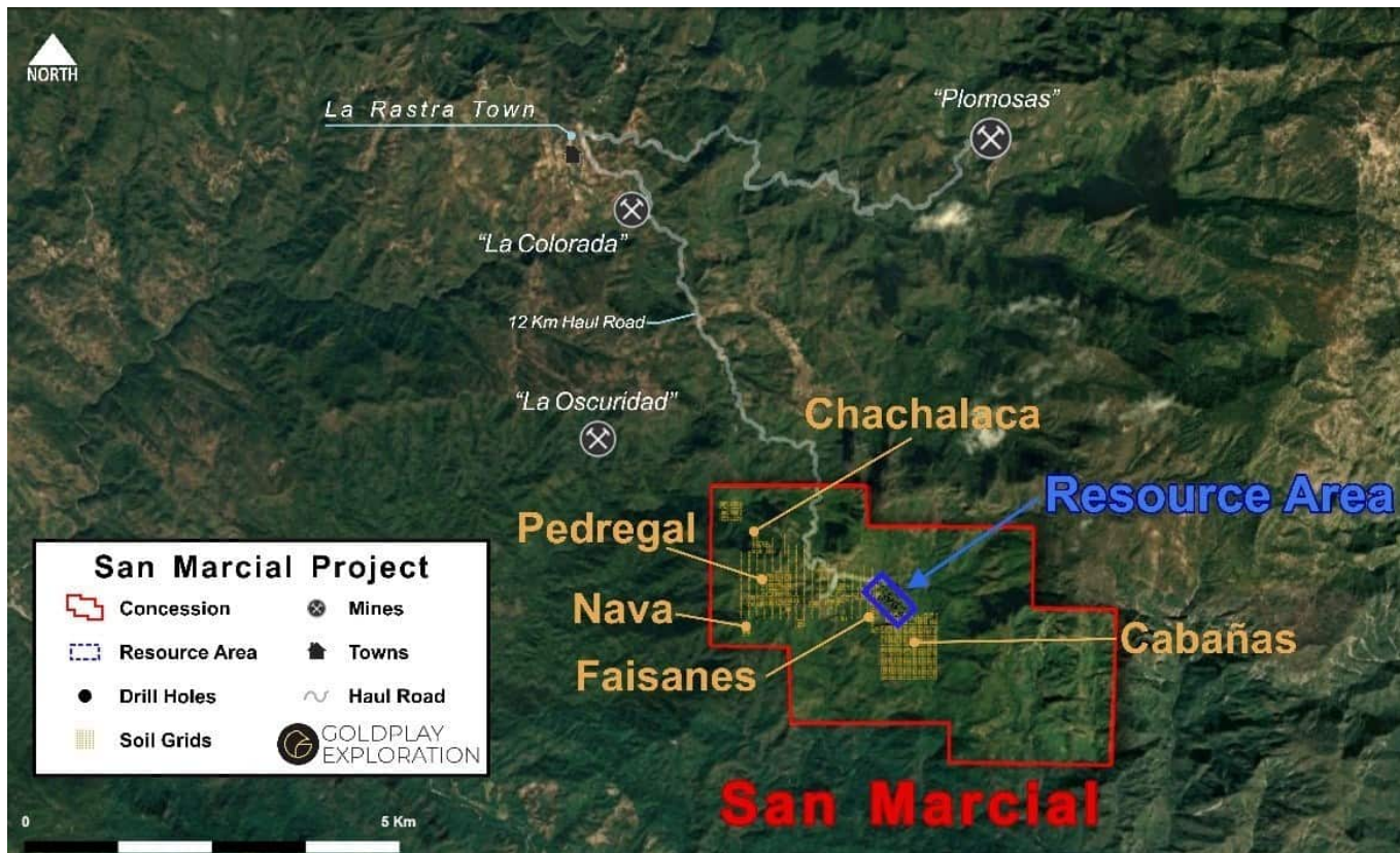
Figure 2 San Marcial – Location of Resource Area and New Targets Inside Concession