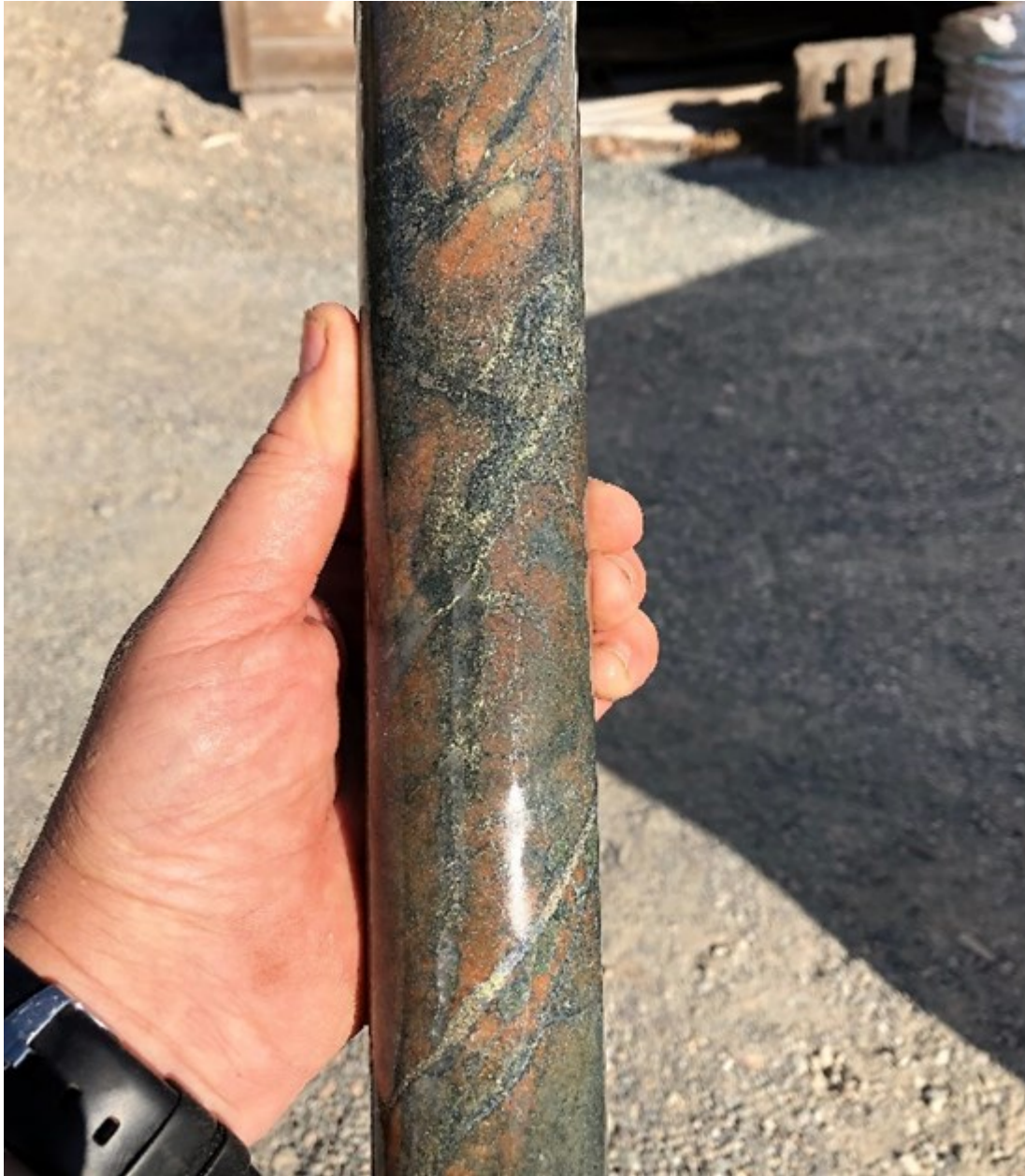
Figure 3: Examples of MPD-20-005 core:

A) Strongly altered porphyry with sulphide veining dominated by chalcopyrite at 333 metres. Core is from a 3 metre sample reporting 1.19% Cu, 0.55 g/t Au and 6.40 g/t Ag at 332.0 to 335.0 metres.