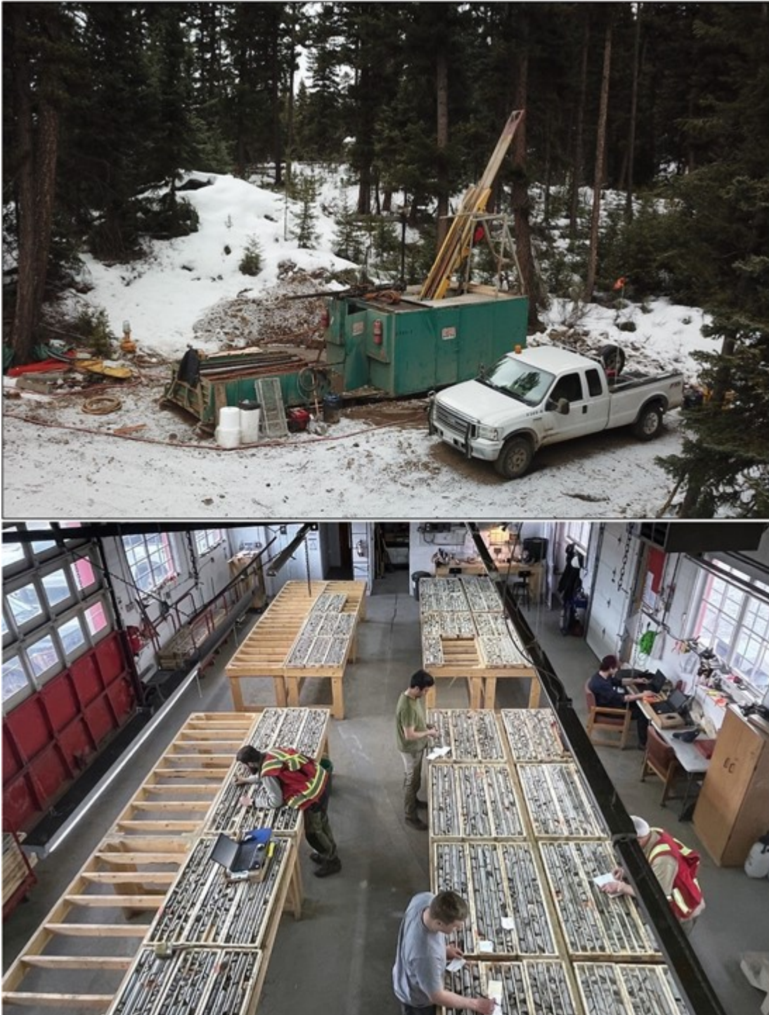
Figure 3: 2022 Drilling at Gate and core logging at Kodiak's facility in Merritt, BC

To view an enhanced version of this graphic, please visit: