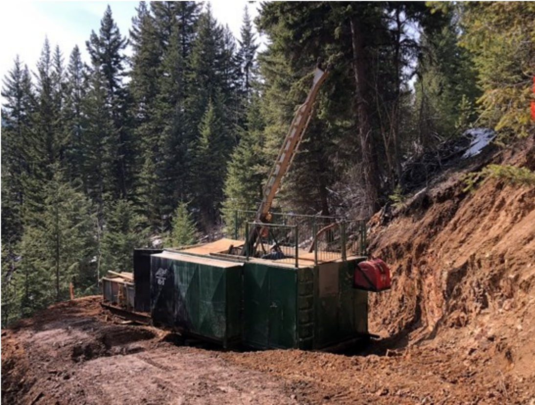
Figure 2: 2021 Drilling at Gate Zone, MPD and Core Logging Facility, Merritt BC

https://orders.newsfilecorp.com/files/3803/83554_69a33e9964acdbb4_002full.jpg