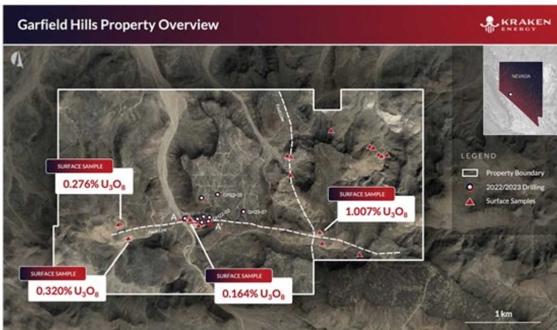
Figure 1: Phase 1 Drill Program Plan Map

To view an enhanced version of this graphic, please visit: https://images.newsfilecorp.com/files/8684/168858_0eb8a4d28412684f_001full.jpg