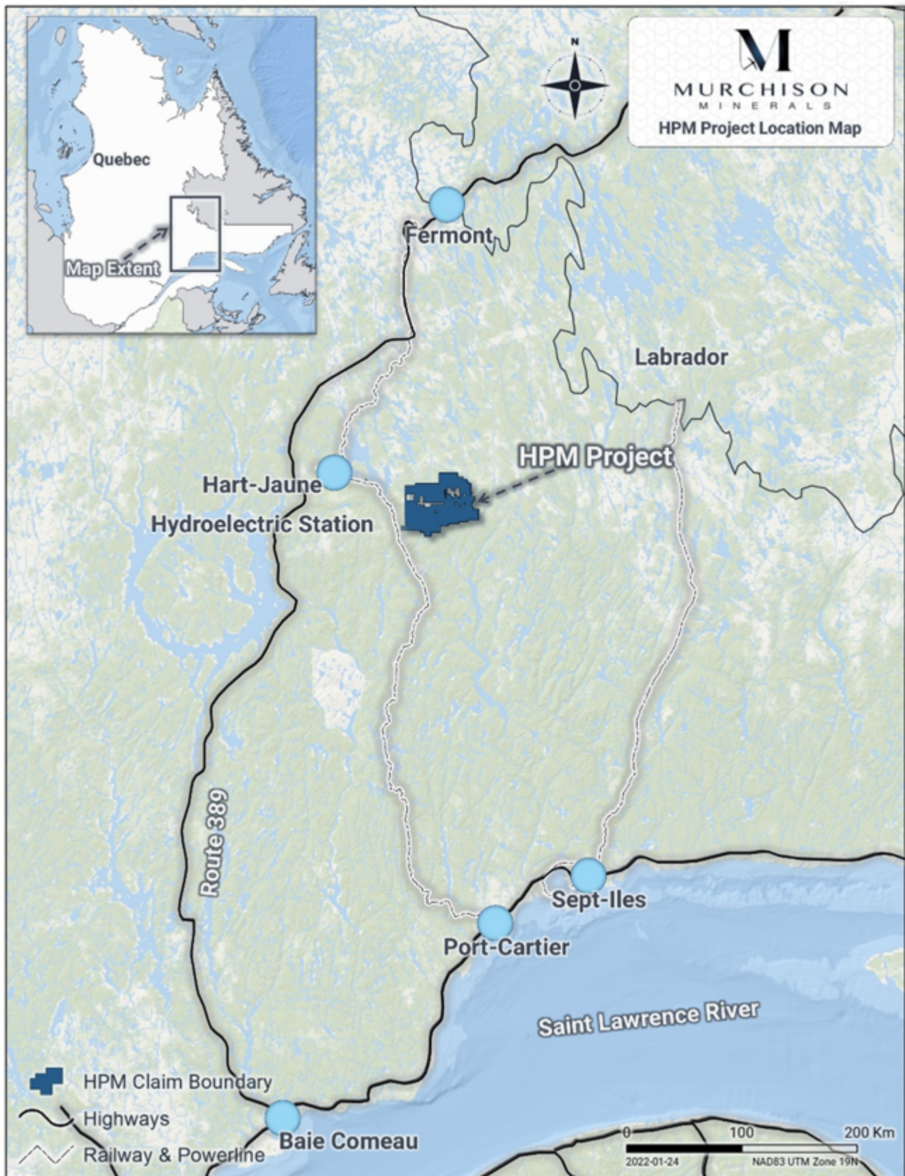
Figure 1: HPM Location Map

The HPM Project is located within the Haut-Plateau de la