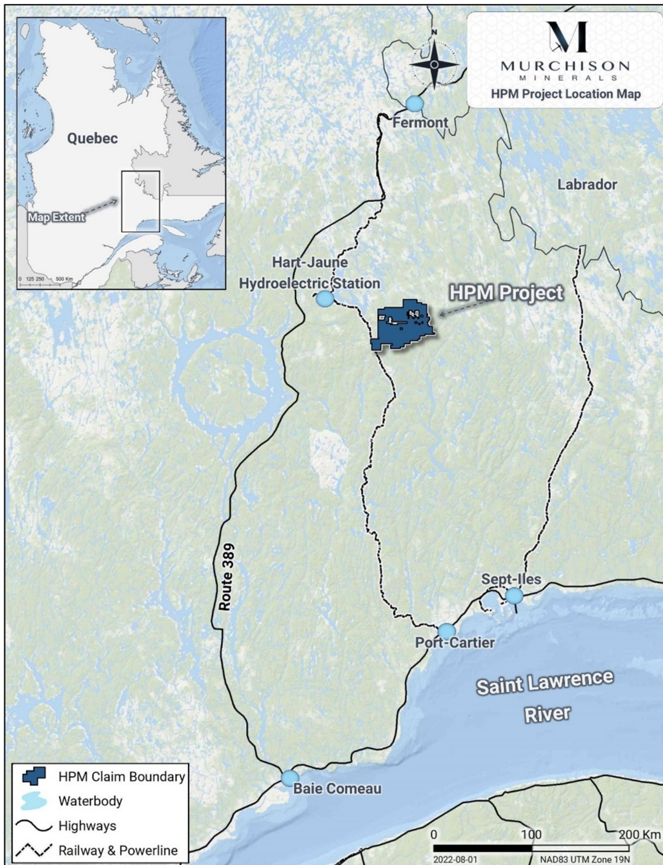
Figure 2: HPM Location Map