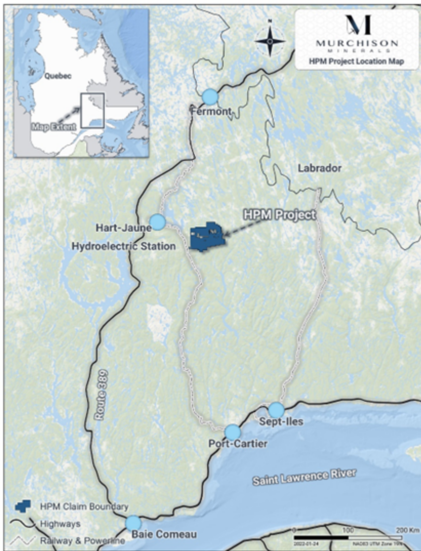
Figure 4: HPM Location Map

The claims host prospective gabbroic, ultramafic and anorthositic bodies within the Manicouagan metamorphic complex and are associated with significant nickel-copper-cobalt sulphide mineralization first identified by Falconbridge in 1999, where they discovered extensive nickel-bearing sulphide mineralization at BDF during drilling in 2001 – 2002. Murchison Minerals Ltd.'s predecessor – Manicouagan Minerals – drilled in the area in 2008 and 2009. The majority of the past drilling at the HPM Project targeted the BDF geophysical conductor and confirmed the presence of nickel-copper-cobalt sulphide mineralization over approximately 300-metres strike length to a depth of 280 metres. The mineralization remains open at depth