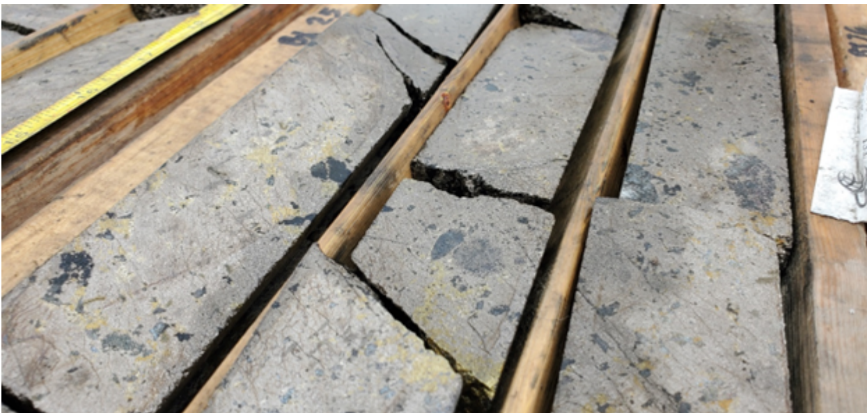
Figure 2: Drill core from BDF with observable pyrrhotite (iron sulphide), chalcopyrite (copper sulphide) and pentlandite (nickel sulphide) mineralization from an interval in Hole HPM08-04 which assayed 1.74% Ni, 0.66% Cu and 0.09% Co over 15.06 metres.

The Company has also recently compiled the drill core from the 2008 exploration program – at the BDF Zone – to a core storage facility in Saguenay, QC. The 2008 exploration program was operated by Murchison Minerals' predecessor company, Manicouagan Minerals, that completed 13 of the 25 drill holes that currently make up the BDF Zone. The mineralized portions of the drill core were stored indoors and remain in great condition (Figure 2). Additionally, the 2008 drill core is now undergoing relogging and geochemical sampling, which will be used to update the current geological interpretation. Those results will also assist in targeting expansion areas at BDF during the summer drill program.