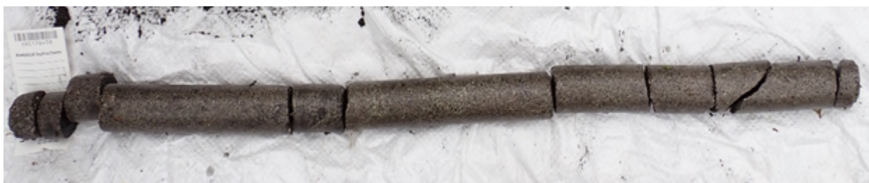
Figure 1: Example of the recently collected backpack drill core from newly located surface BDF mineralization with observable pyrrhotite (iron sulphide), chalcopyrite (copper sulphide) and pentlandite (nickel sulphide).

The Company has completed mobilization of a temporary work camp that will support the diamond drilling phase of the summer exploration program as well as the currently ongoing prospecting program. The prospecting program consists of 3 teams which are utilizing GDD's "Beep Mat" technology to locate near surface nickel-bearing sulphide mineralization associated with the newly identified geophysical anomalies. Any anomalies that are detected using the Beep Mat are then sampled using a small backpack diamond drill. Preliminary work at the BDF Zone has been successful in locating multiple new areas of surface mineralization, assays are pending for those samples (Figure 1).