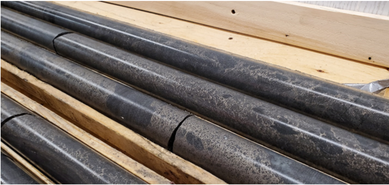
Figure 2: Semi-massive and breccia pyrrhotite mineralization observed in hole PYC21-001

UTM Projected Coordinate System: NAD83 UTM Zone 19N.