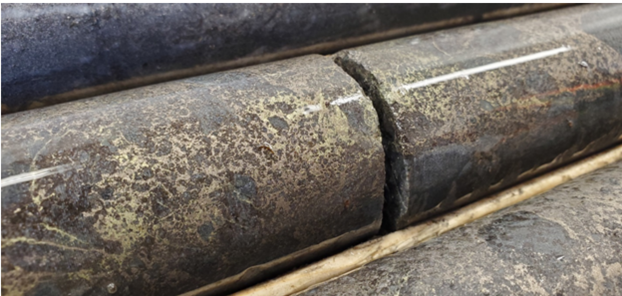
Figure 3: Close-up of pyrrhotite and chalcopyrite mineralization within hole PYC21-001.