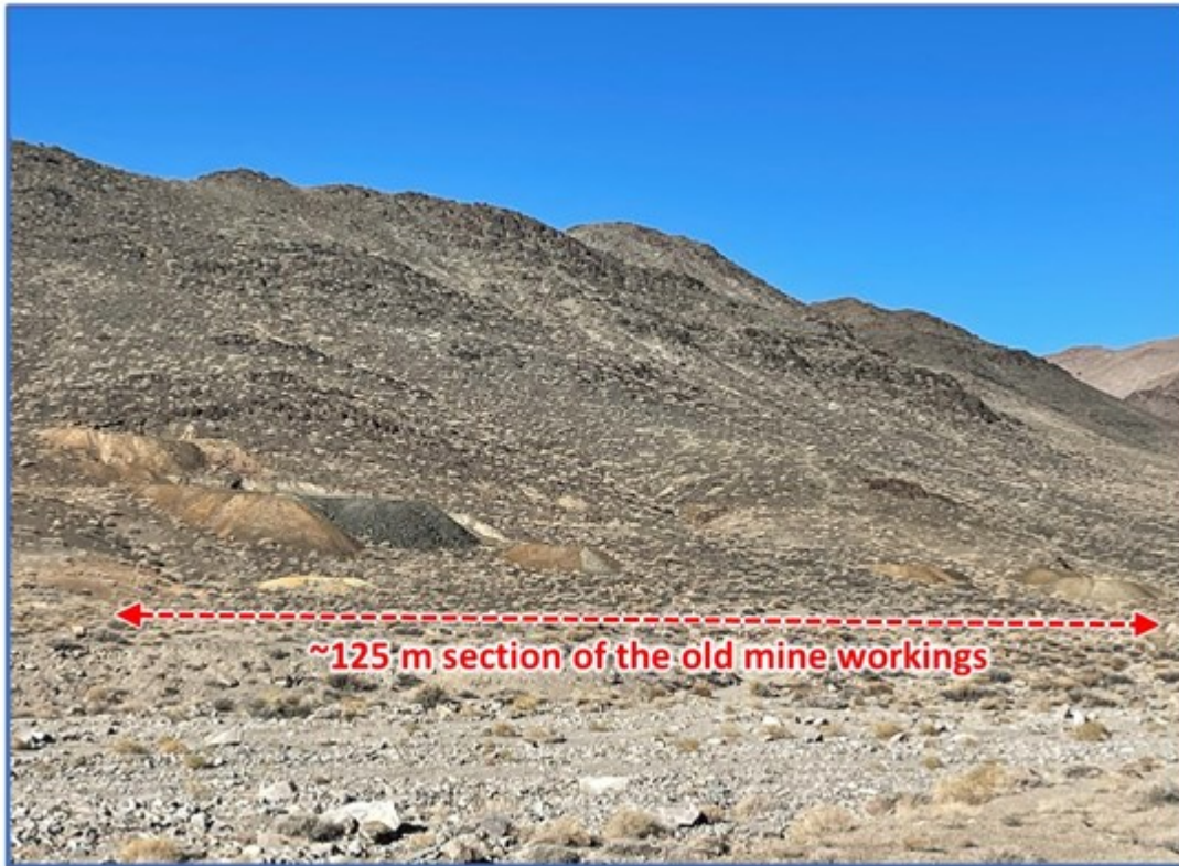
Photo 4: Old mine workings at the Dry Gulch Gold-Tungsten prospect

To view an enhanced version of Photo 4, please visit: