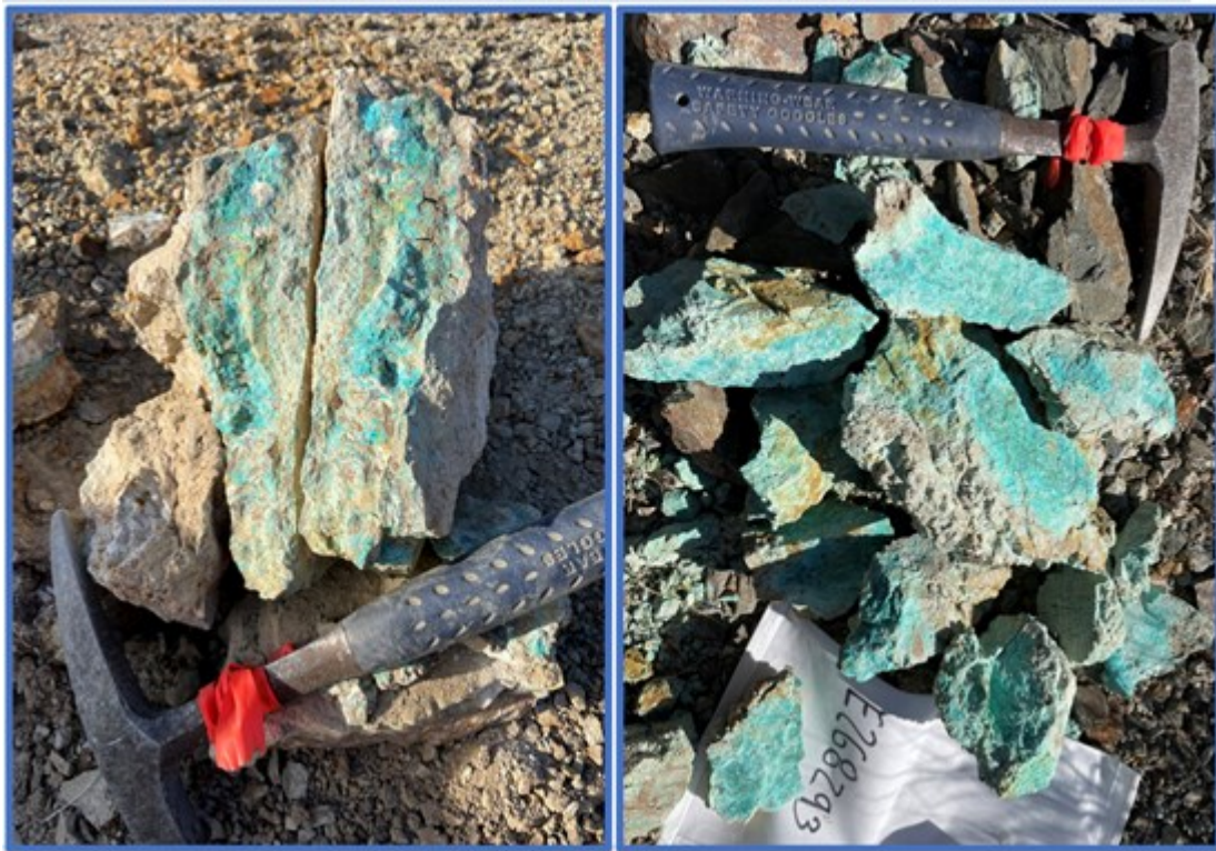
Photo 5 (left): Massive copper-rich barite zone. Photo 6: (right) Copper rich, chrysocolla stained boulders from unnamed prospect

To view an enhanced version of Photo 5 and 6, please visit: https://orders.newsfilecorp.com/files/5376/109865_fd7b195d64e5290d_006full.jpg .