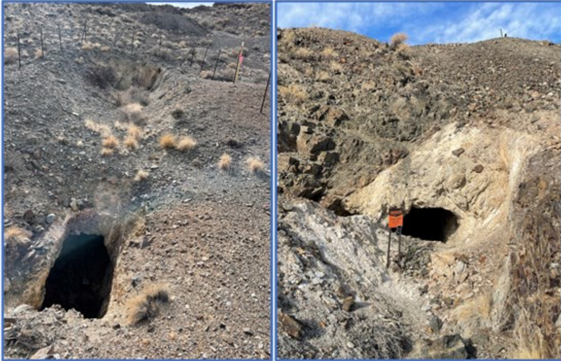
Photo 2 (left): Open stopes along the NW Montreal veins, southern end. Photo 3 (right): Highly altered, mineralized zone at the NW Montreal mine site. One of many such workings.

https://orders.newsfilecorp.com/files/5376/109865_fd7b195d64e5290d_003full.jpg .