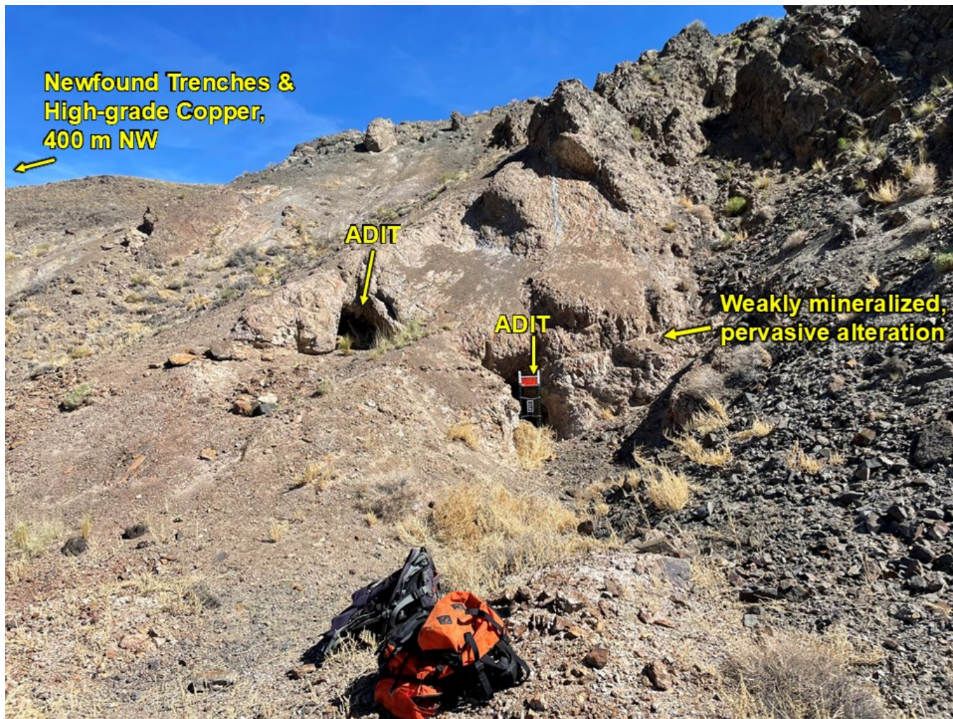
Photo 3: Pervasive, discoloured, sericitic, iron stained alteration at Honeycomb Hill.

To view an enhanced version of this graphic, please visit: https://images.newsfilecorp.com/files/5376/221207_15de8ecf94bea8fe_006full.jpg