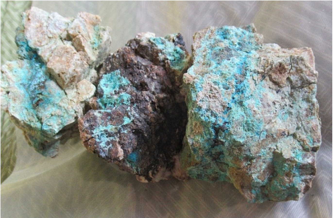
Photo 1: Sample B994732 from the newfound trenches 400 m NW of Honeycomb Hill. Assayed 26.96 g/t Au, 10.4 g/t Ag, >10% Cu.

To view an enhanced version of this graphic, please visit: