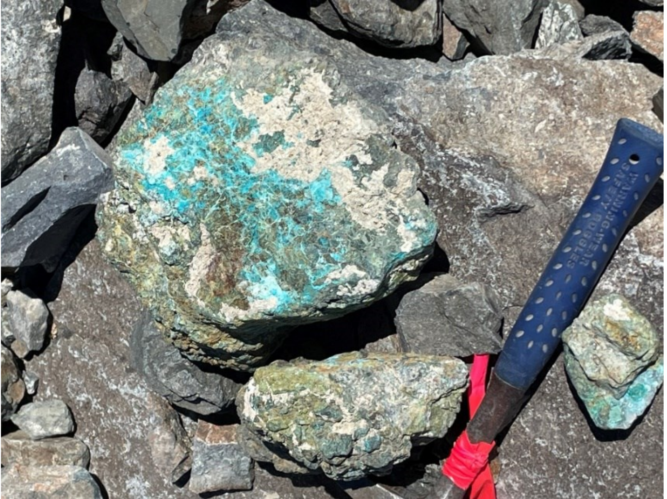
Photo 2: Epidote-garnet skarn boulders stained with secondary copper minerals (mainly chrysocolla), KIN claims.

samples have now shifted the target for the next work phase to a series of nearby sedimentary units. Such well developed and mineralized skarn boulders indicate that there must be skarn outcrops nearby and that the pluton responsible for the skarns may be at a relatively shallow depth.