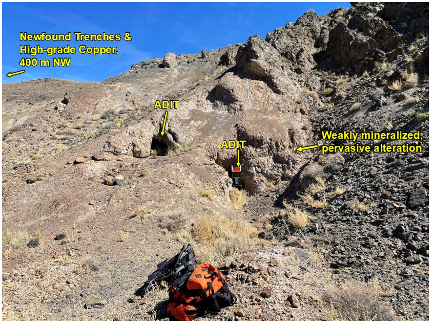
Photo 3: Pervasive, discoloured, sericitic, iron stained alteration at Honeycomb Hill.

To view an enhanced version of this graphic, please visit: