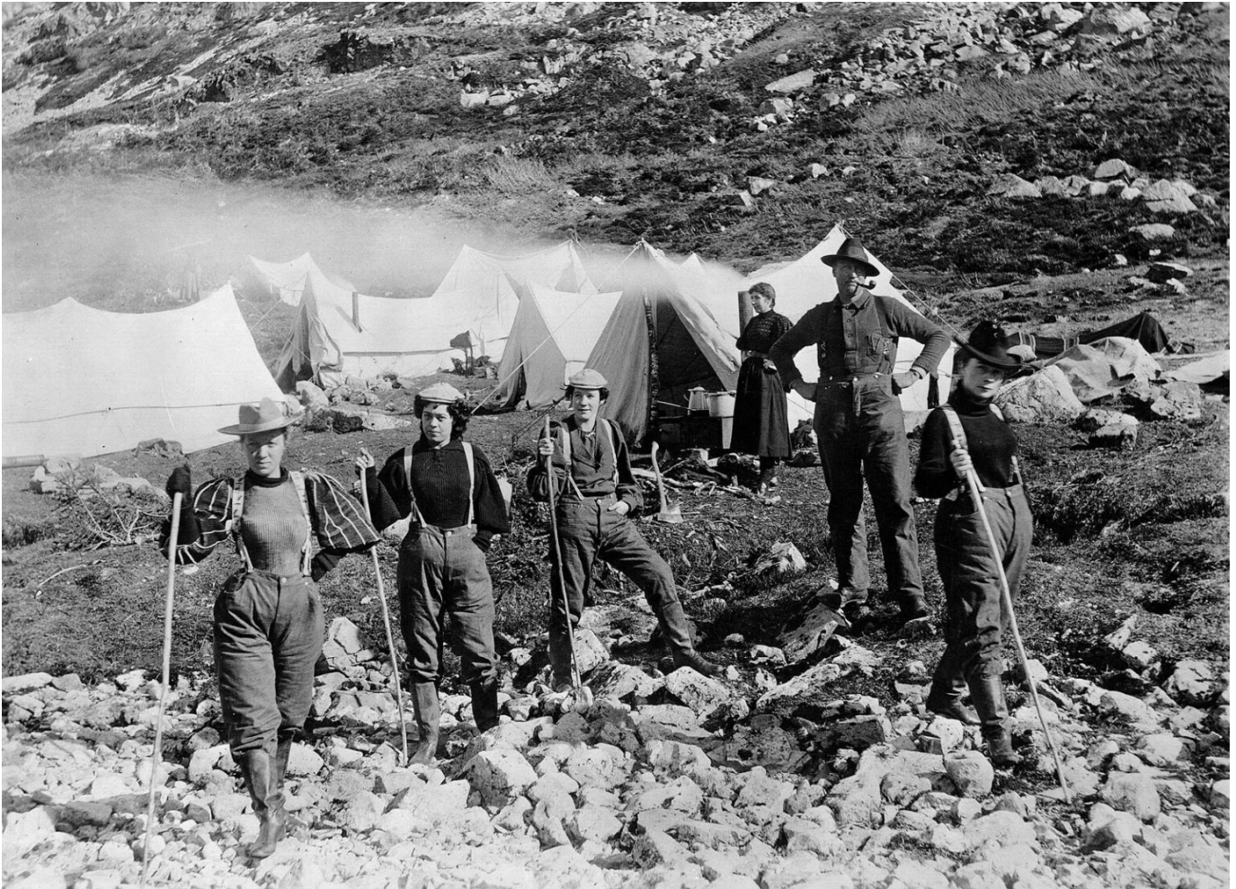
Klondike Gold Rush ca.1899, History Collection

To view an enhanced version of this graphic, please visit: