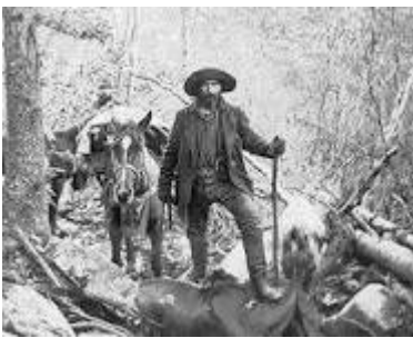
Klondiker on White Pass Trail ca. 1898

Imagine discovering something so valuable that 100,000 people flock to the site of your discovery. This is the true tale of the Yukon Gold Rush. Shaaw Tláa (Kate Carmack), her husband, George Carmack, the son of an American forty-niner, and his partners and brothers-in-law, Skookum Jim Mason and Tagish Charlie (both of whom were Tagish K'wáan First Nations) found gold on Rabbit Creek (now Bonanza Creek) on August 16 th , 1896. The next day, they staked claims along the creek. When the prospectors reached Alaska to sell their gold in July of 1897, the news sparked one of the world's greatest gold rushes. Yukon was made into a Territory of Canada the following year (June 1898).