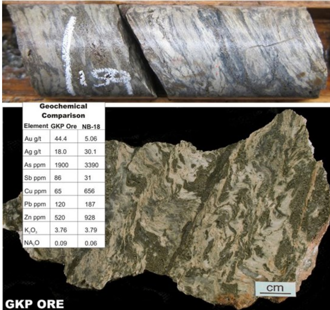
Figure 2 – Core from the gold mineralized zone in hole NB-18 shows identical shear structure, associated minerals and alteration chemistry to the GKP mine ore sample, demonstrating the extension of this style of mineralization onto TerraX's property. Of note are the distinctive potassic alteration ( K_2O_3 ) and sodium depletion ( Na_2O ), with the accessory metals that characterize the Giant Mine ores types.