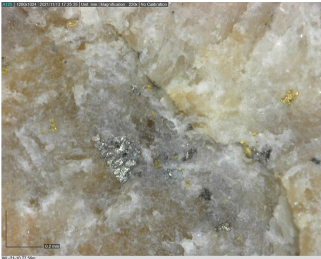
Figure 1 – Visible Gold in Drill Core at Woods Lake

Also at Woods Lake, localized specks of visible gold were documented in quartz veins and breccias both in the primary host QFP and in narrow quartz veins in the footwall, specifically at 129.82m of WL-21-04. This further confirms that gold mineralization potential exists outside the primary host intrusive rocks and broadens the scope of potential targets.