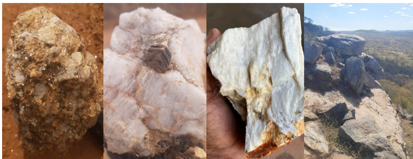
Figure 1. Grab Samples from Vatic’s Solonópole South Lithium

December 6, 2023 ( Source ) – Vatic Ventures Corp. (the “Company” or “Vatic”) (TSXV: VCV) (FSE: V8V) (OTCQB: VCVVF) is pleased to announce that it has entered into a share purchase agreement with arms length vendors (the “Optionors”) to acquire, subject to TSX Venture Exchange (“TSXV”) approval, a 100% interest in a private company which holds an option to acquire a highly prospective hard rock lithium property (“Solonópole South”). The property hosts multiple extensive lithium bearing pegmatite dykes that recently returned initial grab samples of 5.03% Li 2 O, 3.72% Li 2 O and 3.41% Li 2 O.