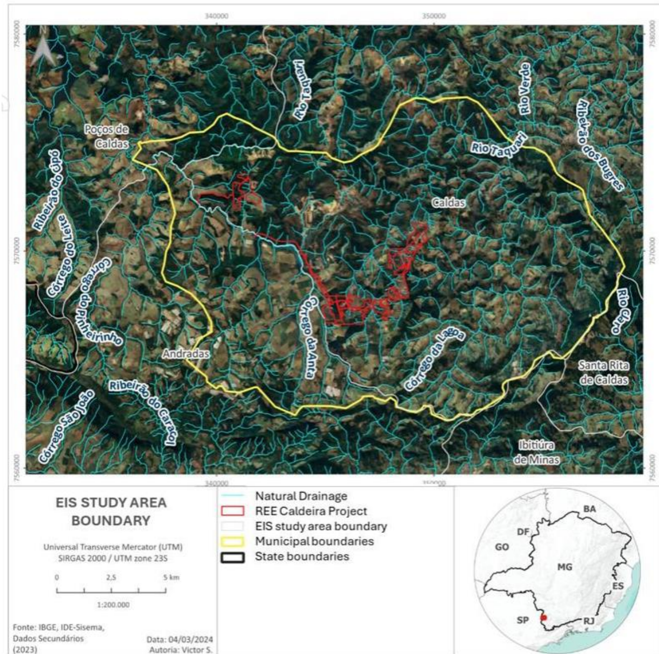
Figure 2: Caldeira Project EIS Study area.

The EIS fieldwork, studies and reports were completed three months ahead of schedule and cover the proposed Caldeira Projects Rare Earth processing facility site and the Southern Licences of Soberbo, Capão do Mel and Figuera. Environmental permitting remains on track for the issuance of the Construction License within the two year time frame as afforded with the MOU from the State Government of Minas Gerais. Pleasingly, the Social Mapping component of the EIS Report outlines a community acceptance level of 89% for the Project.