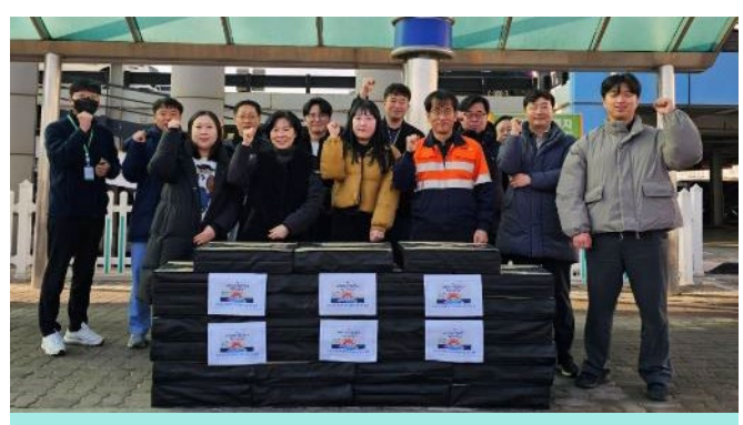
Fruit sharing activities in the Ochang Foreign Investment Zone

To celebrate the Lunar New Year, employees at the KMP once again participated in the annual fruit-sharing initiative organised by the Ochang Foreign Investment Zone Committee. The program is designed to strengthen community ties and bring together local enterprises to extend holiday goodwill to residents. The KMP's involvement underscores its ongoing commitment to corporate social responsibility and dedication to building constructive and enduring relationships with the surrounding community.