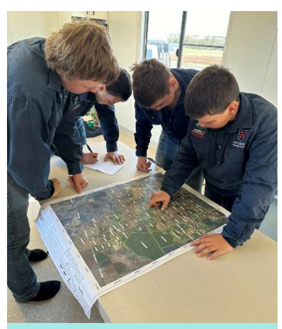
MAPP students on site at TPC.

ASM and Toongi Pastoral Company will once again be participating in the Annual Dubbo Show. If you're local to the Dubbo area and would like to learn more about our work and the opportunities that we are bringing to the region, please come along and speak to the team.