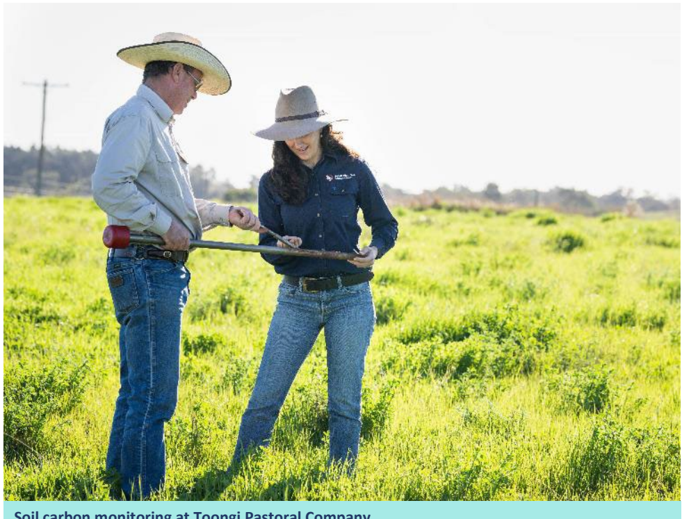
Soil carbon monitoring at Toongi Pastoral Company.

Having had the Toongi Soil Carbon Project formally registered with the Clean Energy Regulator towards the end of 2024, the first review of the project was conducted during the Quarter. The review was carried out by Climate Friendly - having acquired Australian Soil Management earlier in the year. ASM expects to receive the analysis report from Climate Friendly in Q2 2025.