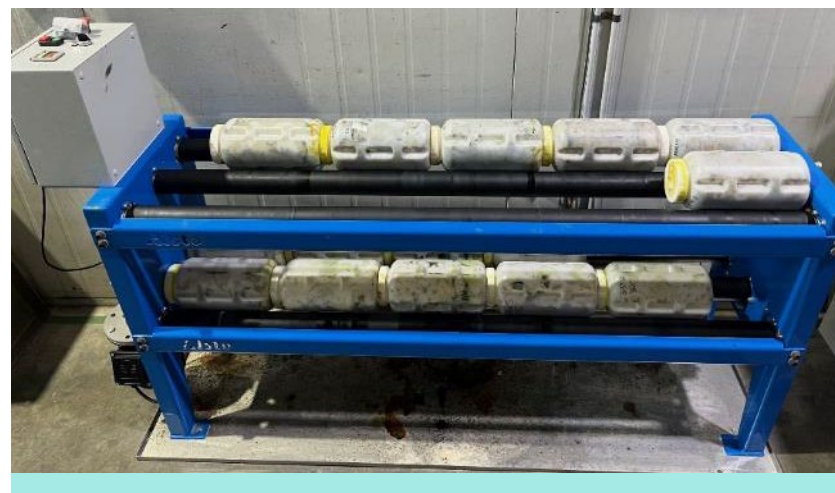
Hydrochloric acid bottle roll tests at Core Resources.

The study and testwork on all options will continue to be